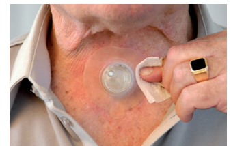
Use of a Remove wipe on top of a FlexiDerm adhesive to help with adhesive removal