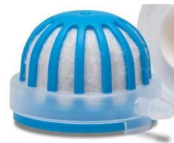
The O2 Adaptor mounted on a Blue Freevent XtraCare

Freevent O2 Adaptor is an accessory to Freevent XtraCare for patients requiring additional oxygen. The adaptor connects oxygen tubing of 1/8 inch (3.2 mm) diameter to the oxygen port. The device is for single use and should be replaced at least every 24 h, when it becomes dirty, contaminated or shows any signs of damage.